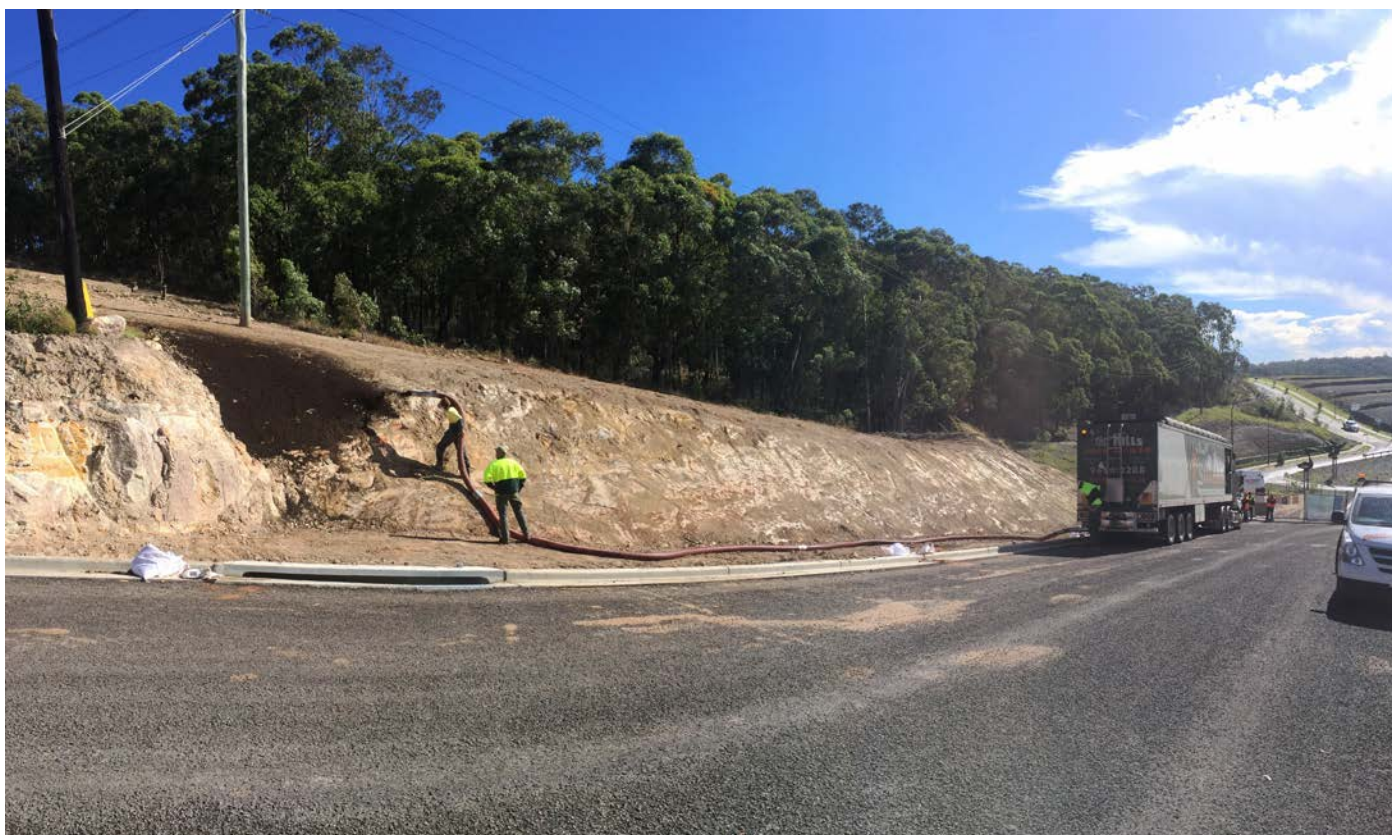
Compost blanket being installed straight onto sandstone batter at the Lake Macquarie site.