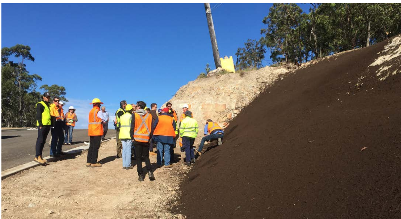
Inspecting a roadside compost blanket at a Lake Macquarie demonstration.

The project aimed to breach the gap between knowledge and practice through site-based learning.