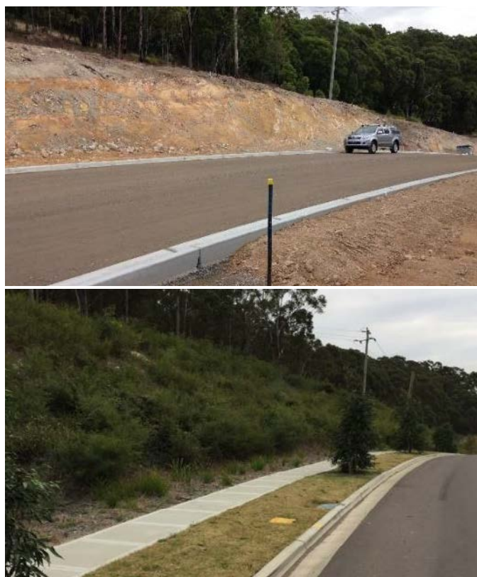
Figure 2: Lake Macquarie site before the compost blanket was installed, and 12 months after.